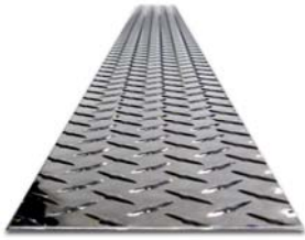
Chair Rail MX™