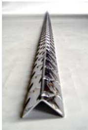
Corner Protector MX™