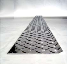
Base Molding MX™