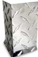
Base Molding MX™ Outside Corner P/N: HBMOB