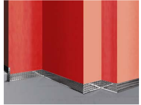
Base Molding MX™ P/N: HBMA.LL