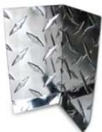
Base Molding MX™ Inside Corner P/N: HBMIC