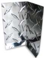
Base Molding MX™ Inside Corner P/N: HBMIC